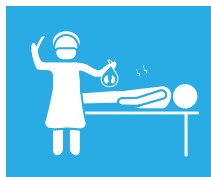
removal of organs

•Children account for 1 in 3 victims of human trafficking worldwide.