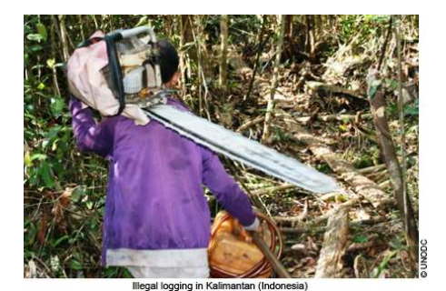
UNODC PARTICIPATION IN INTERNATIONAL FORAS

UNODC field office in Vietnam organized a national workshop for prosecutors, law enforcement officers and relevant Governmental representatives in Vietnam aimed at strengthening collaboration between different agencies and establishing a task force for improving the criminal justice response to illegal trade in timber, especially in the view of the new EU Timber Regulations. The workshop took place in October and produced concrete recommendations in relation to legislation, law enforcement, capacity-building and equipment.