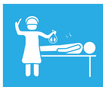
removal of organs

•Children account for 1 in 3 victims of human trafficking worldwide.