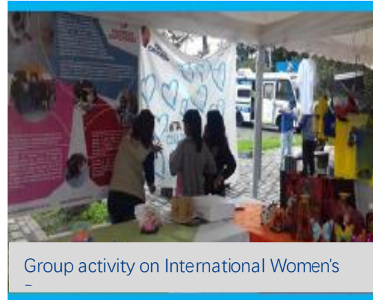
Group activity on International Women's

Almost 40 victims received emergency assistance, including 10 beneficiaries receiving medical care and 14 receiving individual psychological assistance. In addition, 30 people received legal advice and participated in human trafficking workshops, while many received support for the return to their country