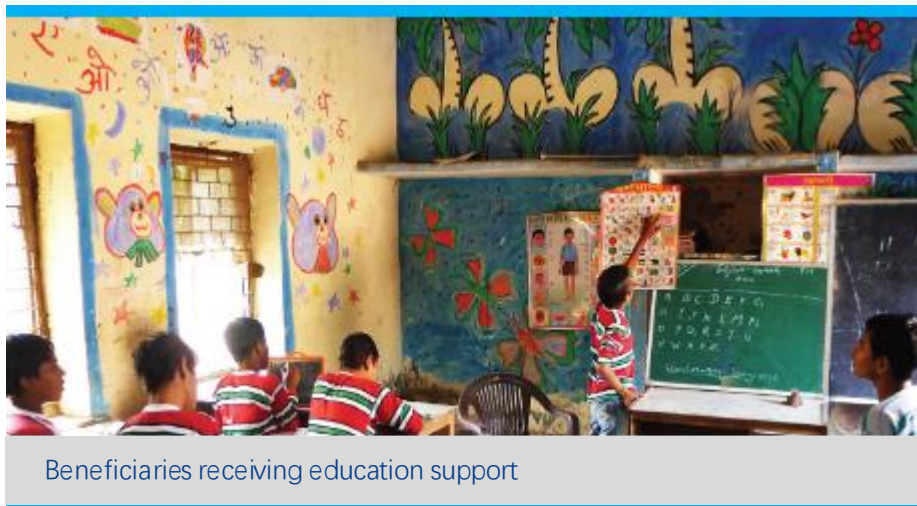
Beneficiaries receiving education support

In the reporting period, 335 children were identified in forced labour from, garment, cosmetic, hotel/dhaba, handicraft etc and legal aid had been provided to all 425 children over the entire reporting period. Overall, AVA/BBA rescued 1211 children out of forced labour, providing victims with shelter including accommodation, basic needs, psychological support, medical care and educational support, as well as legal aid and refunding owed-wages. Impressively, the organization was responsible for the closure of 34 factories engaged in forced child labour – serving as a strong deterrent against organized crime networks in the region.