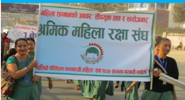
External Networking Interactions with Stakeholders and May Day Rally

The project assisted 141 victims of trafficking through the provision of rescue, housing, food, legal aid and access to justice, medical care, skill and enterprise development; 16 women were