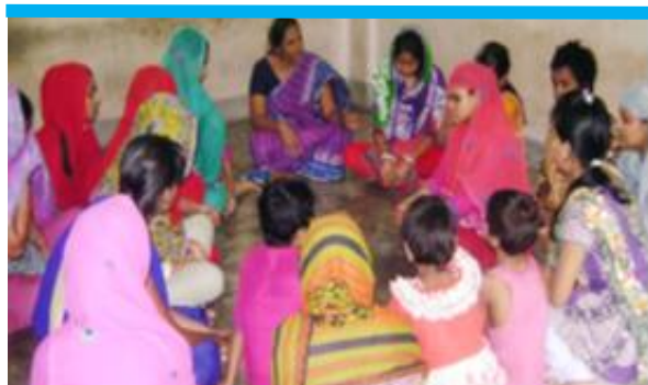
Support provided to beneficiaries

Jessore, including food, health and hygiene support, counselling, education, life skills training, vocational training, family contact and job placements. In addition, DAM disseminated anti-trafficking messages to 3,000 vulnerable households in Jessore areas.