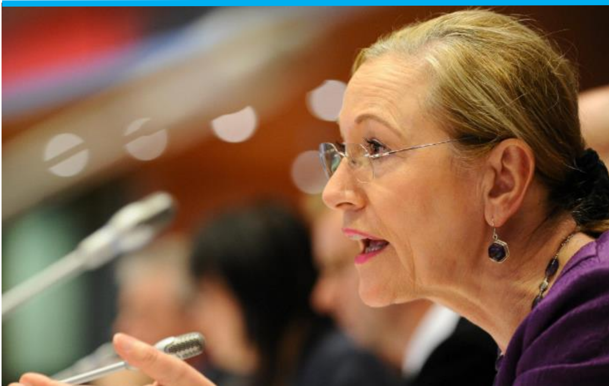
Representing the Trust Fund, Ms. Benita Ferrero-Waldner addressed the panellists of the High-Level Meeting of the UN General Assembly on the Appraisal of the Global Plan of Action to Combat Trafficking in Persons convened in New York on 27 -28 September, 2017

in court. The work of NGOs supported by the Trust Fund was closely coordinated with national efforts, she said, adding that it provided strategic legislative support. She thanked the donors for their contributions and pledges to the Trust Fund in 2017, with a special mention to Italy for its generous donation of USD 1,000,000.