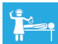
removal of organs

labour, domestic servitude, begging, petty crime, forced criminality, removal of organs and other exploitative purposes. Others are exploited in fisheries, mines, brothels, farms and homes among other places. Some victims are physically imprisoned by locks, bars or guards while those with apparent freedom to leave are controlled by other