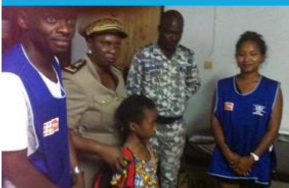
Family reunification in Galebré, Gagnoa

Since 2010, Cavoequiva has been committed to young girl victim of trafficking, sexual and labour exploitation, including providing care, creating a Young Girls house, and providing courses in sewing, flowers art and cooking.