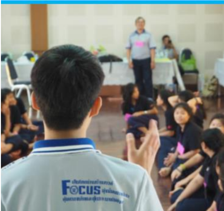
Children's group activity at FOCUS