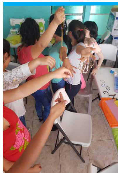
Girls playing at the El Refugio shelter

Low capacity of the Justice System: El Refugio will ensure staff to provide follow up to legal cases against traffickers, in order to support the application of the Guatemalan law.