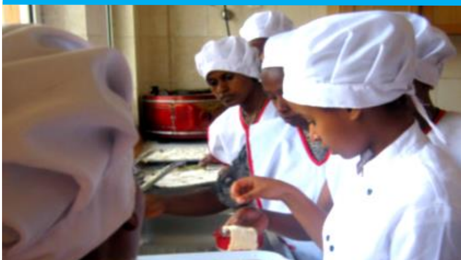
Beneficiaries receiving training at Agar Ethiopia Rehabilitation Centre