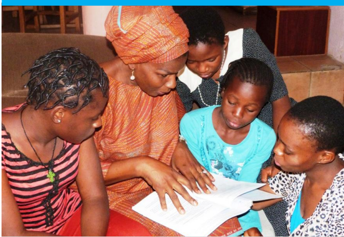
WOTCLEF counselling sessions