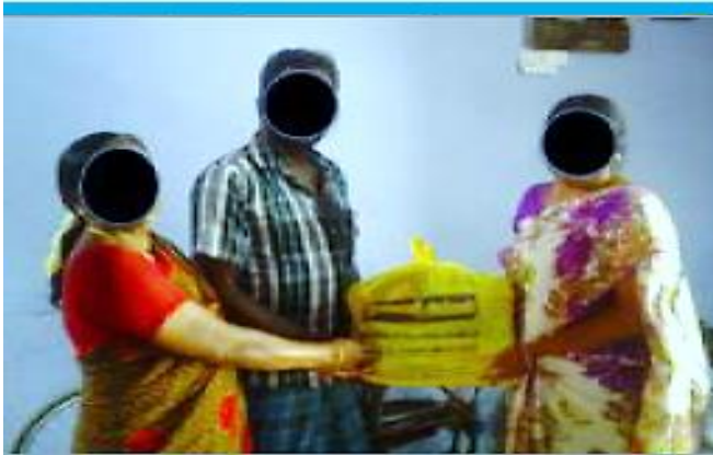
COFS health camp and distribution of food aid for survivors of Erode, Tamil Nadu

By the end of the first half of the third year of this project, COFS-India field staff assisted 69 survivors, including the provision of over 217 services. This included 36 in Erode and 33 in West Bengal. Survivors were provided medical services, additional legal counselling and livelihood assistance. Plans are still being developed for each of their livelihood support projects. COFS-India has continued to co-develop livelihood assistance with survivors to improve long-term sustainable income generation as an important protection and survival measure.