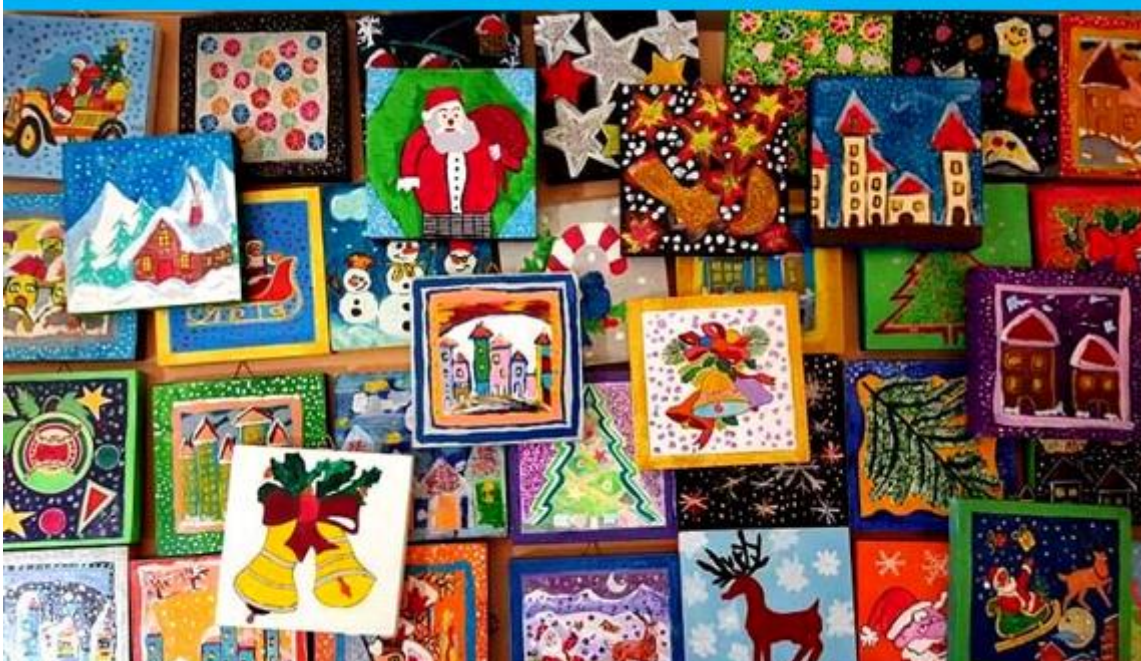
Art therapy for survivors – Bazaar Christmas

of building up step by step a more independent life and autonomy for each beneficiary. All 92 beneficiaries and their dependents improved their physical, emotional and economical security through the specialized assistance and protection offered by M-Power project.