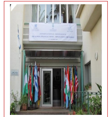
The Golda Meir Mount Carmel International Training Center

**Medical Declaration Please provide a signed letter from your doctor confirming your fitness to attend the seminar.