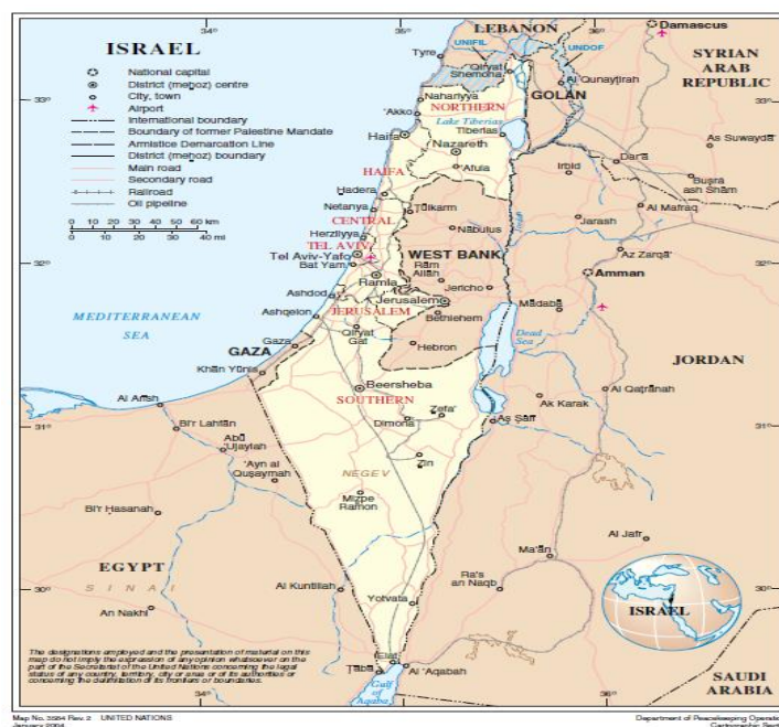
Map of the State of Palestine

The State of Palestine consists of the non-contiguous West Bank including East Jerusalem and the Gaza Strip with a densely packed population. Its unique socioeconomic context is characterized by political and economic tensions, and has created conditions that facilitate the spread of illicit drug use among Palestinians, particularly among youth, women and family members of current drug users. 12 The use, trafficking and selling of drugs is a growing problem, creating an array of social, psychological, health, economic and political problems for Palestinians. Drugs include marijuana, prescription medications (anti-depressants, Z-hypnotics, benzodiazepines and analgesics), and novel psychoactive substances (NPS) ( 'sintetique marijuana' ), with reported high dose use of methadone, morphine, phencyclidine, barbiturates, benzodiazepines, synthetic opioids such as Tramadol, and GABA drugs such as pregabalin. There are an estimated 26,500 high-risk drug users (HDU) in