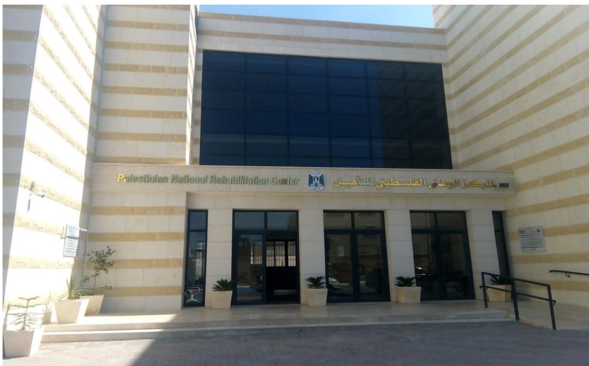
The Palestinian National Rehabilitation Centre