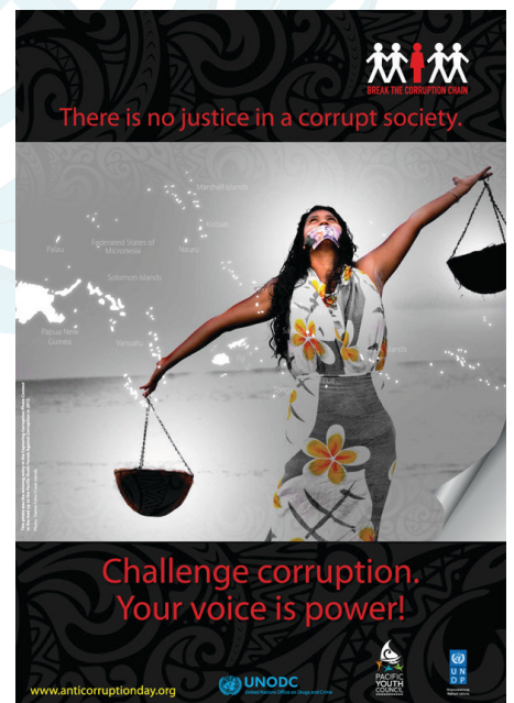
This poster was developed from the photo submitted by the first prize winner of the Youth Forum photo competition

The 2015 Pacific Youth Forum Against Corruption (22-24 February) was the first of its kind in the region and was attended by 45 youth between the ages of 18-30 from 14 Pacific countries. The Forum was jointly organized by UNDP and UNODC