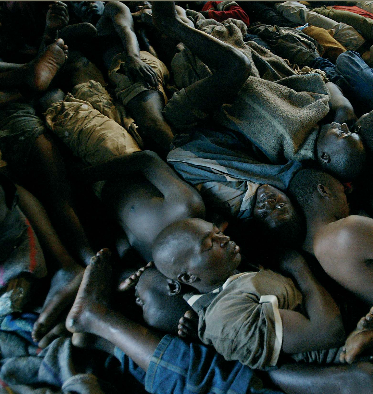
Blantyre, June 29, 2005: Prisoners sleep in cramped positions before being woken up at dawn inside an overcrowded cell in the Maula Prison in Blantyre, Malawi. Some cells have as many as 160 prisoners. Malawi prisons have a good human rights record but they are overcrowded and many of those incarcerated have been on remand for several years due to lack of financial and legal resources.