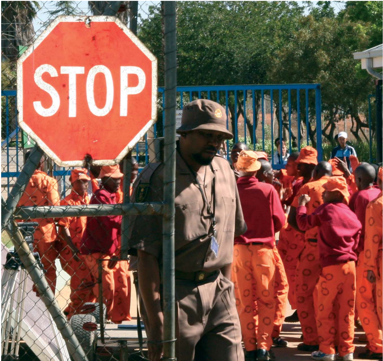
UNODC works with the South African authorities and NGOs to help reduce drug abuse and HIV/AIDS in prisons. This photo shows Leeuwkop prison near Johannesburg.

possible for people in the unlikely setting of a prison to willingly undergo profound personal change is very encouraging.