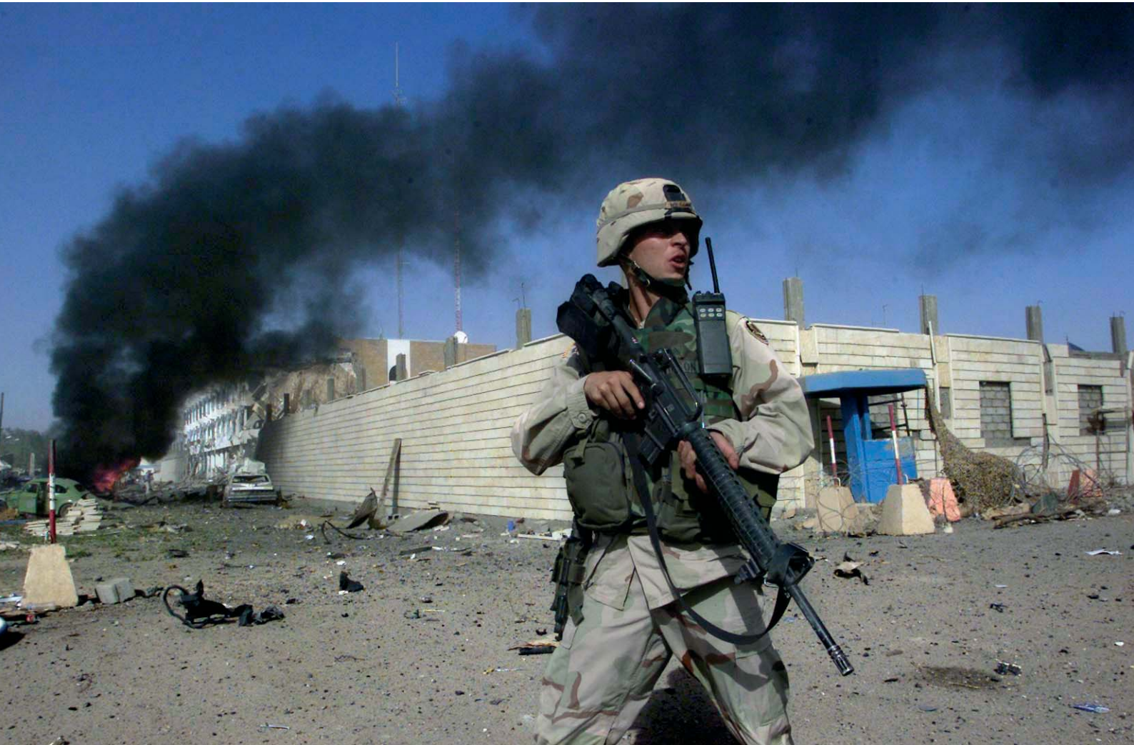
Baghdad, August 19, 2003: A U.S. soldier is photographed at the burning United Nations compound after a huge bomb exploded destroying part of the building.

What was it like to grow up as an immigrant in South Africa?