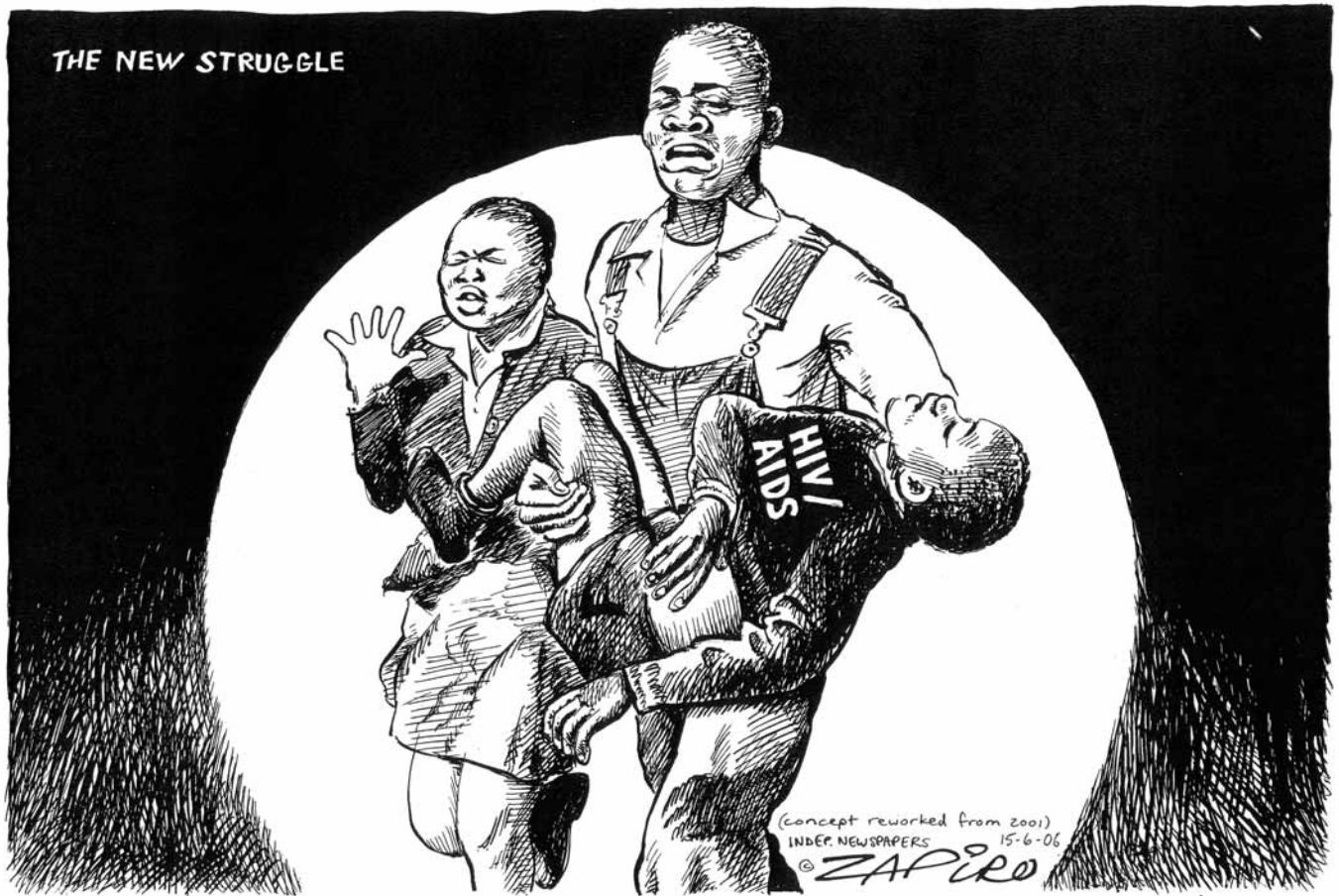
South Africans used to struggle for democratic rights. Now, the struggle has turned to provision of HIV/AIDS treatment.