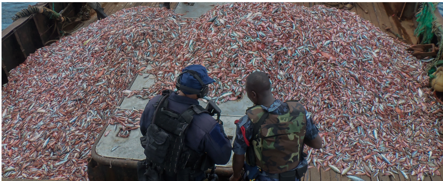
A U.S. Coast Guard law enforcement detachment member and a Ghanaian navy sailor inspect a fishing vessel suspected of illegal fishing.

dering, corruption, document fraud, and trafficking in persons, drugs and arms.